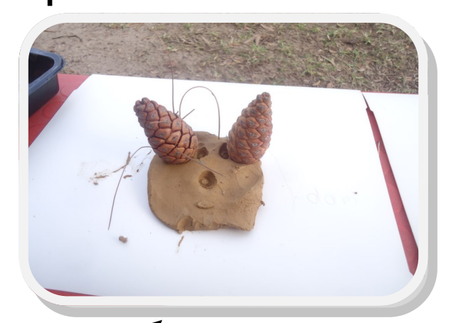
Rats!! / Our child care friends visited.